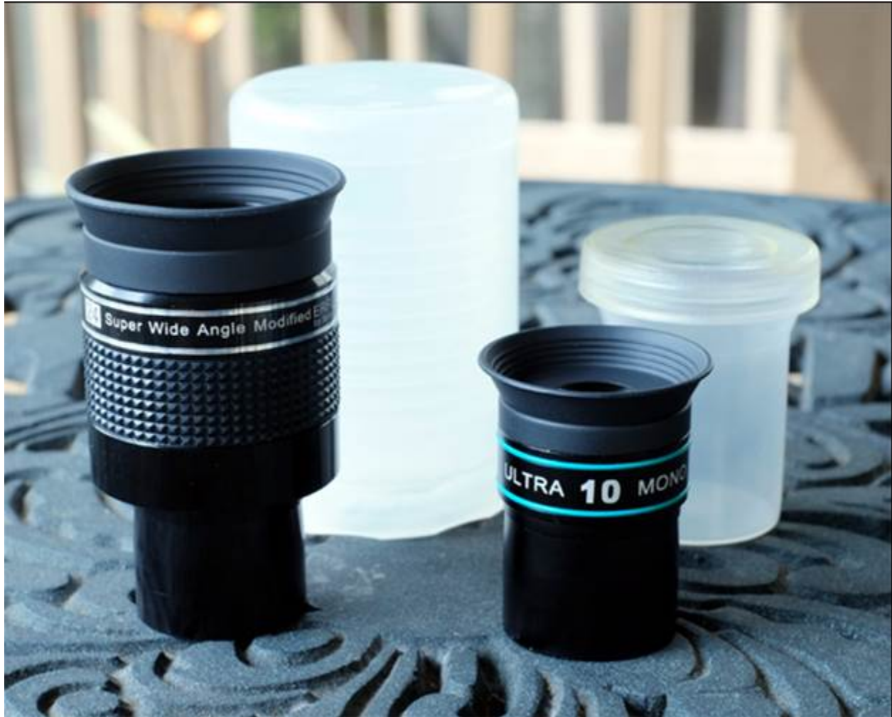
Fig 1. The Burgess 24mm Modified Erfle (left) and 10mm Ultra Mono (right) with their supplied bolt cases.