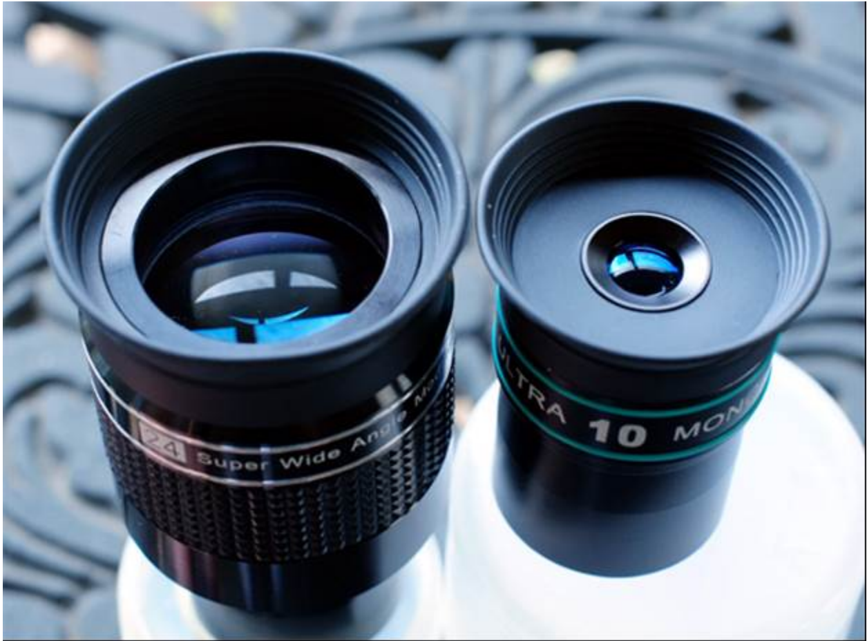
Fig 3. The eye lenses of the Burgess 24mm Modified Erfle (left) and 10mm Ultra Mono (right).

The eye lens on the Modified Erfle is inset deeply into the housing. As a result, most of its eye relief is not usable. However, it still felt comfortable in use and was used most often with the eye guard in the up position. The eye guard is easily removed if desired.