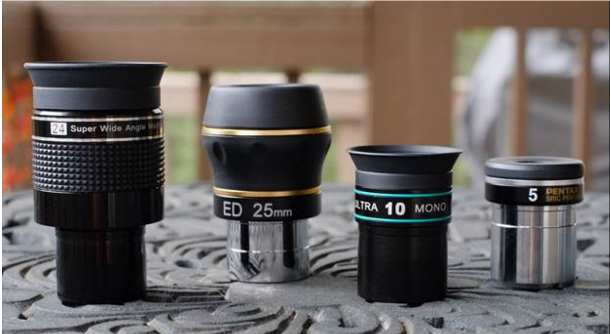
Fig 5: A comparative view of the Burgess eyepieces with the Agena 25mm StarGuider & Pentax 5mm XO.