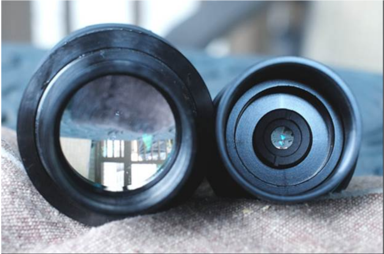
Fig 4. Field lens and barrel interiors of the Burgess 24mm Modified Erfle (left) and 10mm Ultra Mono (right).

Insides of the barrels for both eyepieces, looking at the eye lens, revealed no flat black paint. The interiors were naturally black from the anodization, but still showed a shine (there was no flare or glare noticed during field observations). The threading grooves extended all the way up the barrels to serve as micro-baffling.