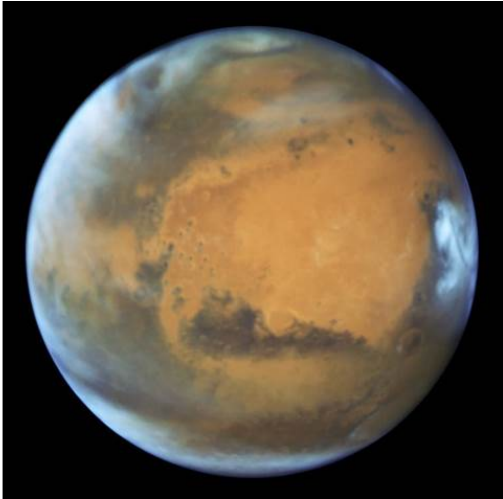
Fig 7. Hubble Space Telescope photo of Mars taken when the planet was 50 million miles from Earth on May 12, 2016.